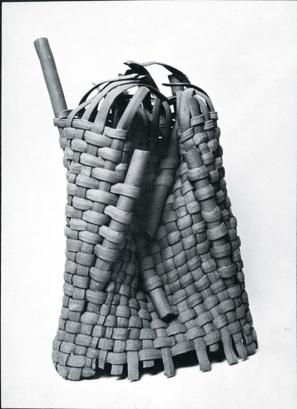
"CERAMIC SCULPTURE" 35" x 20" x 8"